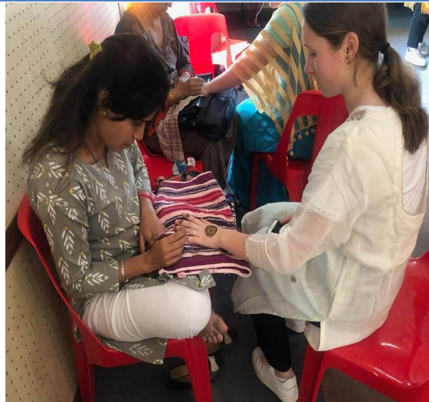
Danish Students Farewell Trust Spend- Rs 15100