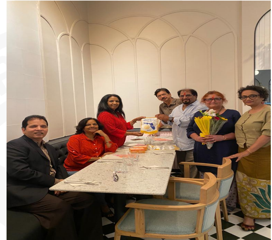
Dinner with Global Partner -Member Contributions Project Cost - Rs 7600